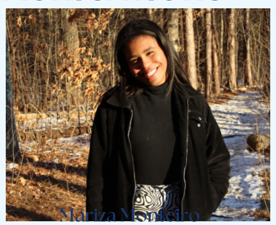
The Washington Center